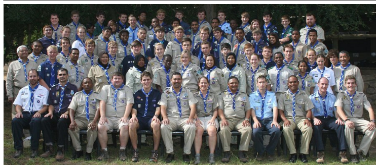
The 20 th successful Gilqua Patrol Leaders Training Unit course took place Friday 1 to Sunday 10 April at Hawequas. Here are the 70 plus leaders and candidates.